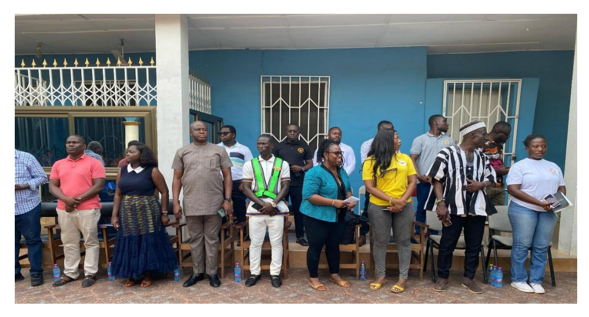
Officials of Minerals Commission and District Assembly at the palace