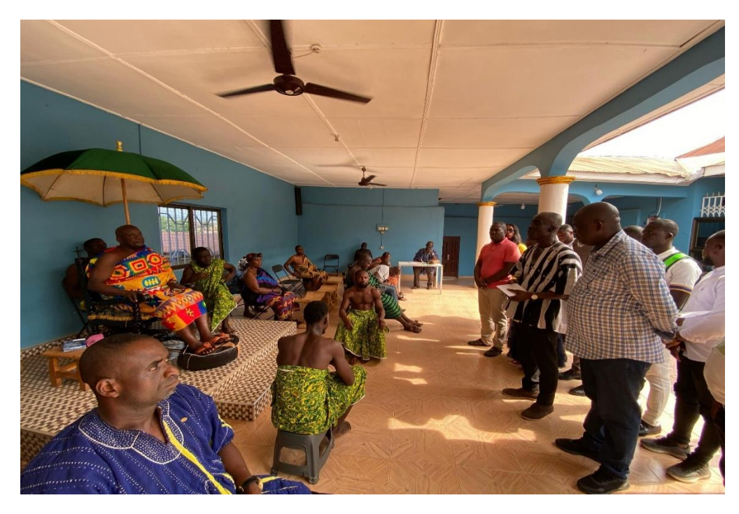
Officials of Minerals Commission and District Assembly briefing the Chief at the palace