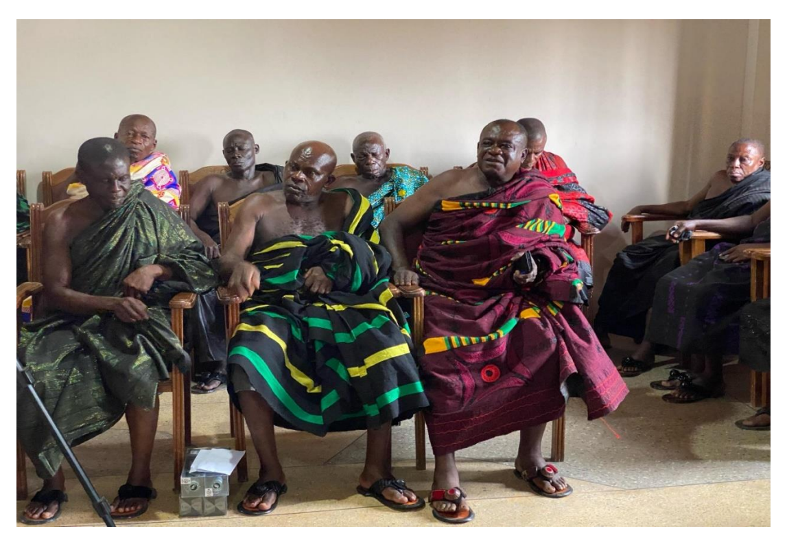
Traditional leaders and Elders at the palace